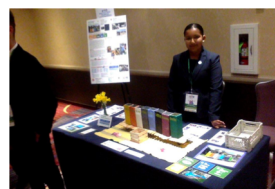
Project presentation at the YIF Showcase, on March 2019

See how easy is to children learn with our container scaled model? Imagine what the containers can do in real size!