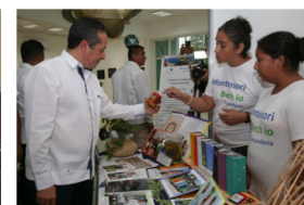
Project presentation to the Governor of Quintana Roo State.